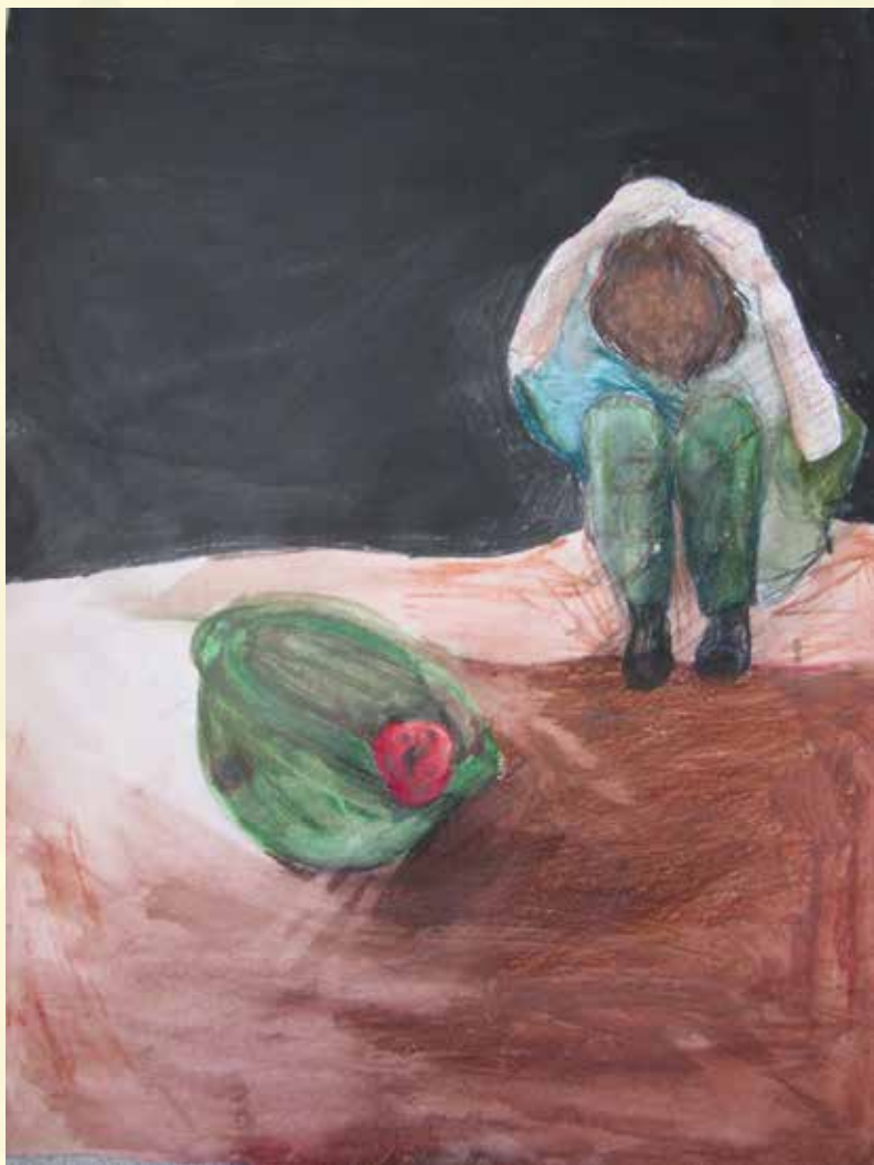
It's for your country

by Madeleine Keating from Archbishop Temple School