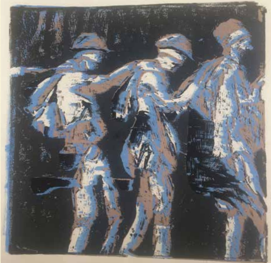
The blind leading the blind by Tallulah Pudney from Brighton College